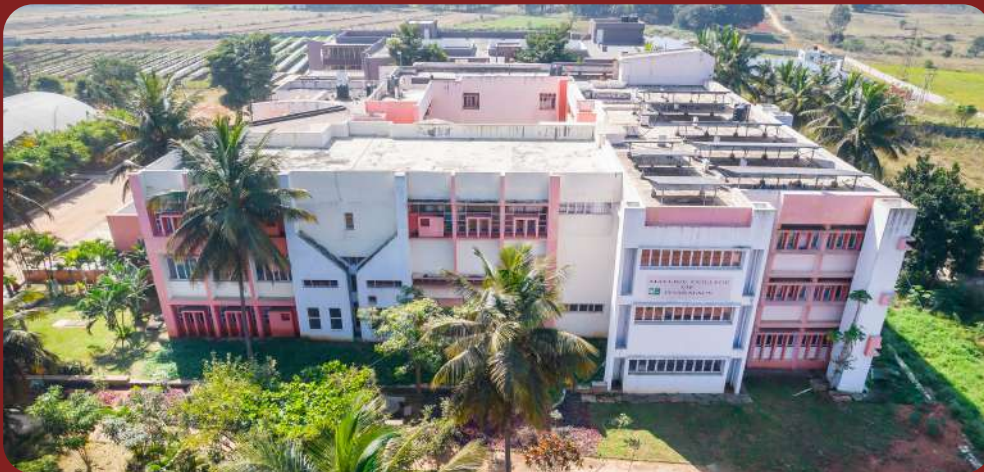
Mallige College of Pharmacy, Bangalore