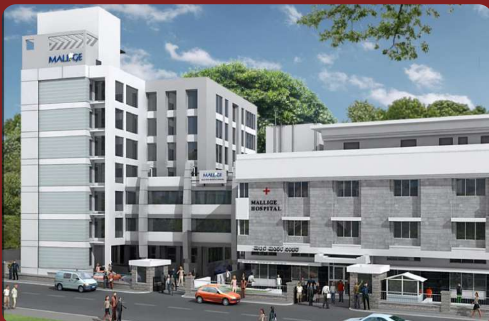
Mallige Medical Centre Private Limited