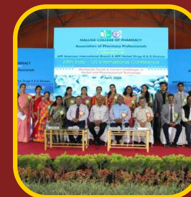
International Seminar @ MCP