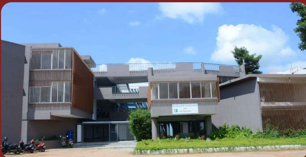
Mallige College of Nursing, Bangalore