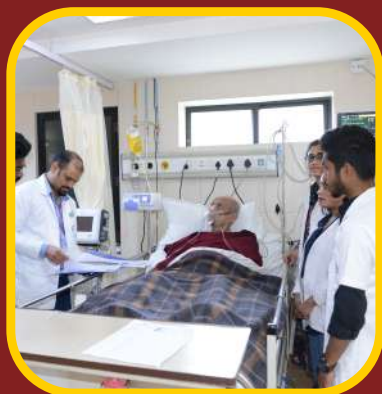
Pharm. D internship